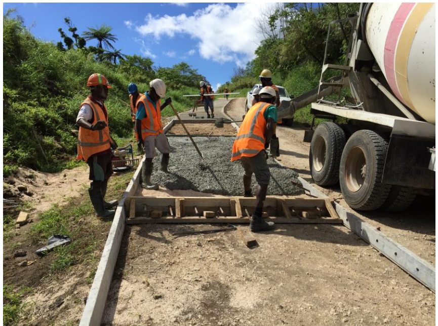
Concrete works underway